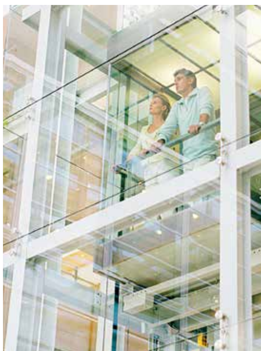
High-efficiency and noise-reduced – INTORQ brake systems perform their duties inconspicuously in lifts and escalators