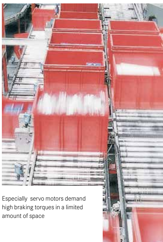
Especially servo motors demand high braking torques in a limited amount of space