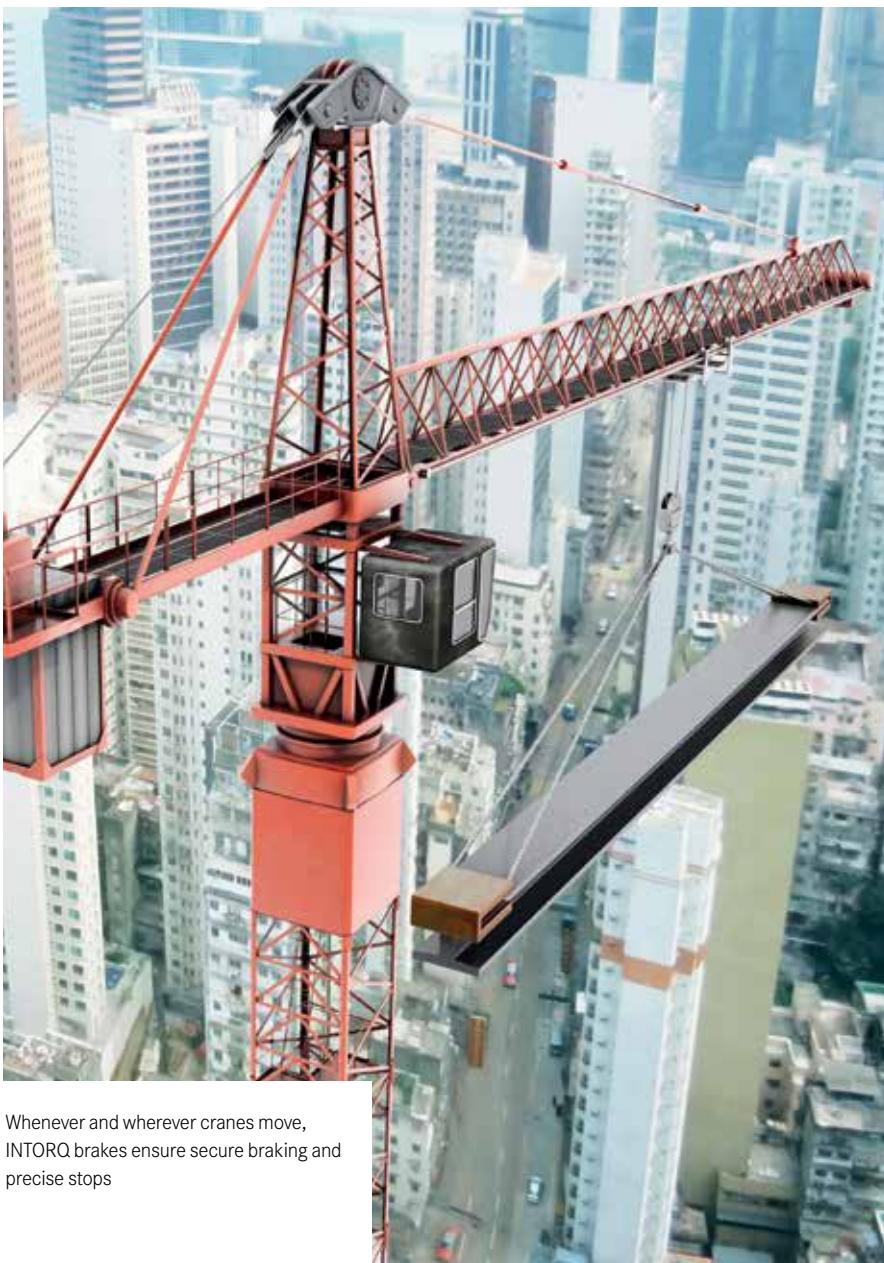
Whenever and wherever cranes move, INTORQ brakes ensure secure braking and precise stops